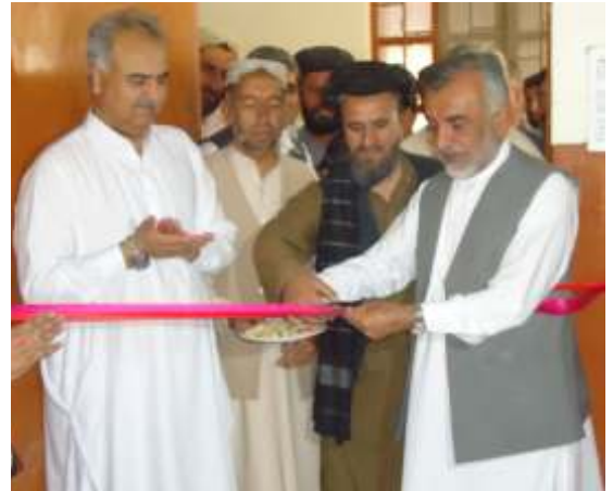
Inauguration of Computer Lab in GGHS Khan Samad Khan

Sardar Raza believes that education is the most vital tool for positive change, progress and prosperity in the life of a nation and the country. It is also the most effective, the easiest and the most economical measure to develop human capital required for the advancement of any country. He was instrumental in the decision of the present Government of Balochistan to adopt education as its first priority and commitment. The government demonstrated interest in the promotion of quality Education by allocating the highest amount of funds in its first provincial budget and this year also has continued keeping education on the top of public investment. Sardar Raza observes that investment in education is inevitable because the province is faced with inadequate access to education which has resulted in low social indicators like ignorance, low productivity, poverty and a threat to peace, cohesion and integrity. He is confident that the present trend of investment on education will change the whole scenario of the province. Under his leadership the education department has developed Balochistan Education Sector Plan 2013-18. The government has adopted the document as a road map for its planning and a guideline for all the generous donors who are interested in the development of the province.